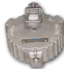
3" (DN 80) PTC