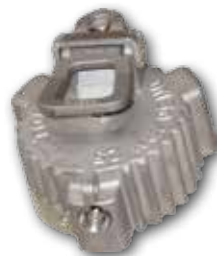
2" (DN 50) PTC