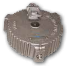
4" (DN 100) PTC